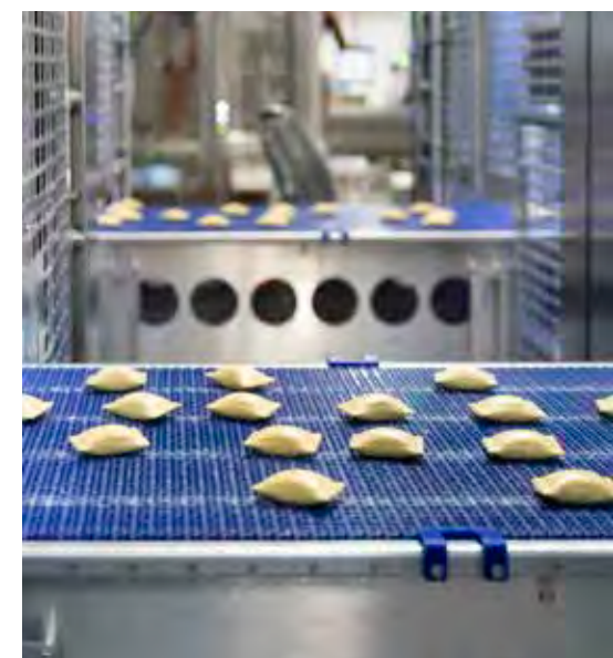
BÜRGER's Swabian “maultaschen” are amongst the company's most successful products.