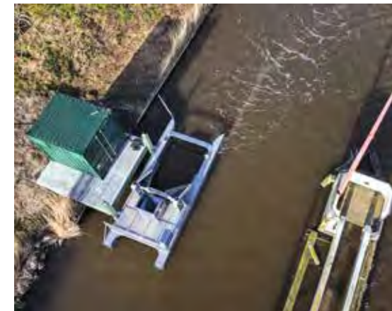
Image above: The bubble barrier and the collection system from above.

When asked about future projects, Erwin Schuitemaker responds: “Our goal is to ultimately rid all rivers and canals in Europe and the rest of the world equally of plastic waste. An additional benefit is that the clean air bubbles can increase oxygen levels in the water, which can improve the ecosystem and prevent the growth of toxic blue-green algae.”