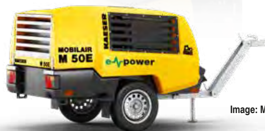
Image: M50E SFC