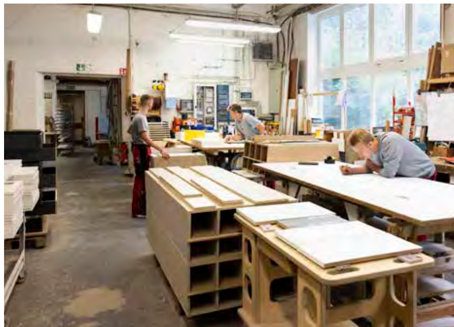
Compressed air is essential for various processing machines at this master craftsman business.

As part of the company's proven approach, extensive consultations took place prior to the purchase of a new compressor from KAESER in March 2023. The requirements included high availability, energy efficiency, and exceptionally clean compressed air to prevent damage to the sensitive wood-processing machinery caused by oil, water, or other contaminants. The chosen solution was a KAESER SK 25 rotary screw compressor, delivering a flow rate of 60 to 95 cfm and a pressure of 90 to 190 psig. Rotary screw compressors are renowned for their cost efficiency and reliability, thanks to the optimised airend featuring KAESER's energy-saving SIGMA PROFILE. Addi-