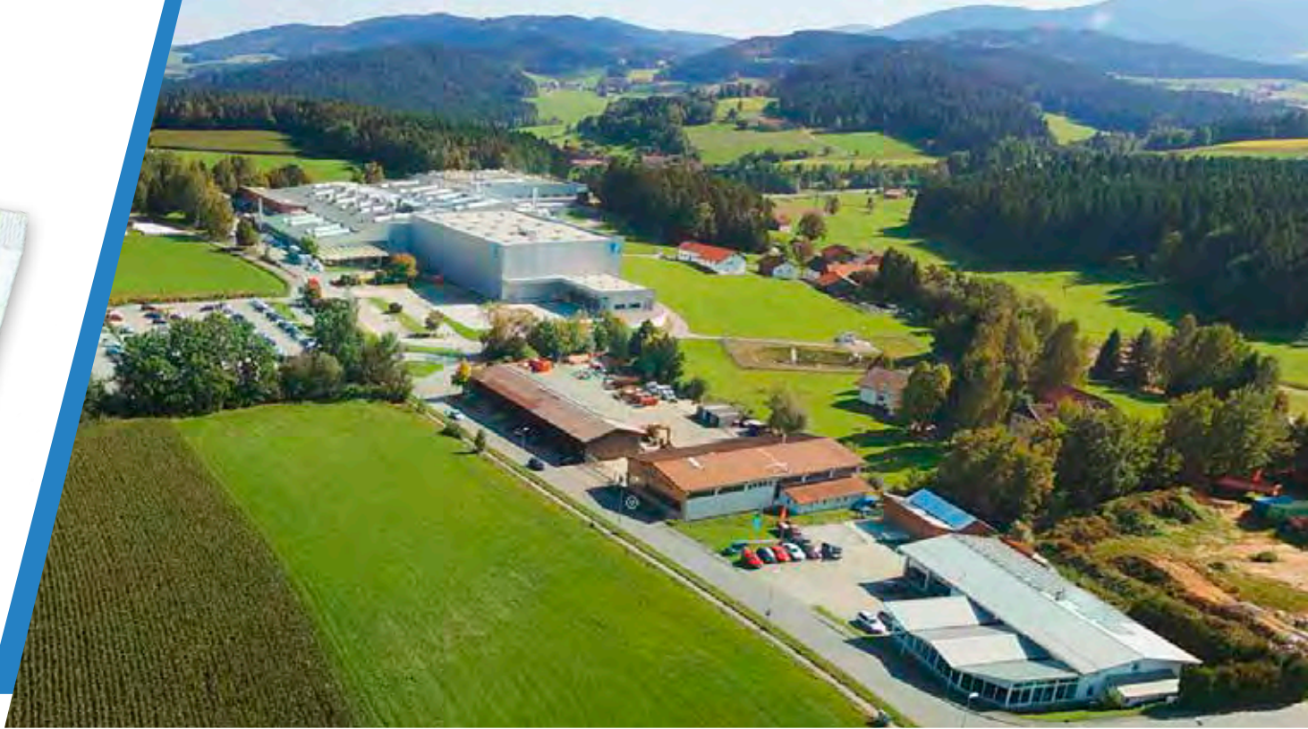
The LINHARDT facility in Viechtach, Lower Bavaria, nestles amid a beautiful, verdant landscape.