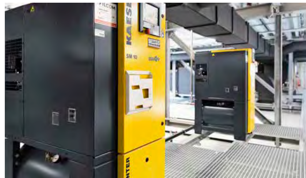
Two AIRCENTERS are installed at the new logistics centre.

To meet the strict quality standards required for BÜRGER products, both plants are also equipped with two energy-efficient KAESER refrigeration dryers, together with multiple KAESER Filters and activated carbon adsorbers. This setup ensures reliable compressed air treatment that complies with purity class 1:4:1 according to ISO 8573-1:2010.