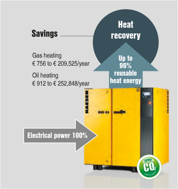
“Energy savings through heat recovery” is a key topic at the KAESER exhibition stand